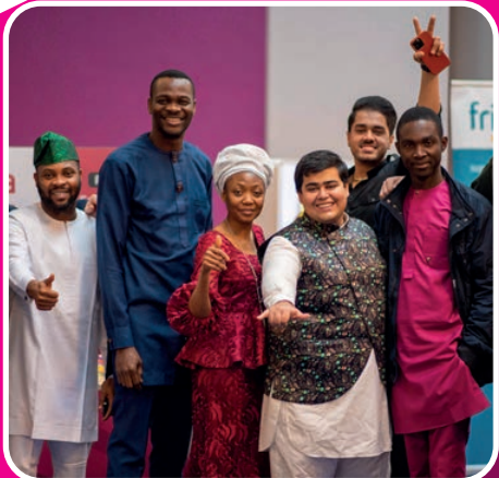
TOP: The Freshers Pub Crawl MIDDLE: Societies & Sports Awards Ball BOTTOM: Dress For Diversity Day